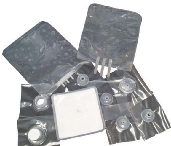
Fluid bags use ports, tubes and fitments to get fluids in and out of bags. These most often are attached using heat sealing and RF welding.

One feature these fluid bags have in common is the need to have ports for getting fluids in and/or out of the bags. Ports, tubes or fitments are installed and heat sealed or welded into the bags. The ports, tubes and/or fitments for these bags most often are attached with the heat sealing and RF welding tech-